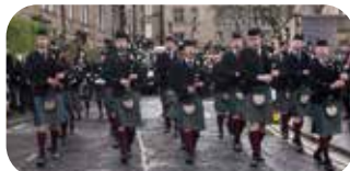
The Stockbridge Pipe Band