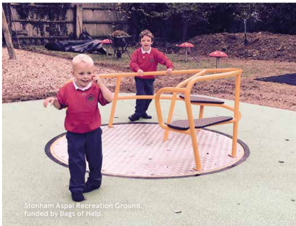
Stonham Aspal Recreation Ground, funded by Bags of Help.

Apply now by visiting tesco.com/bagsofhelp