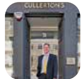
Mark Cullerton Estate Agents