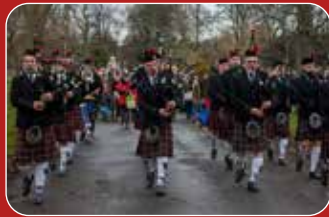
Glencorse Pipe Band